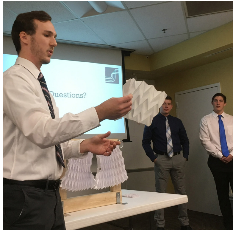
UC Forward students present a proposal to Standard Textile

This innovation course was conducted with corporate partner Standard Textile to support interdisciplinary teams of students from Mechanical Engineering, Environmental Engineering, Art History, and other disciplines in developing a new approach to addressing energy efficiency, privacy, and functionality for the windows of the future. A research and development engineer from the company led the teams through design and patenting processes to produce four proposals, two of which were selected for cash awards and further development.