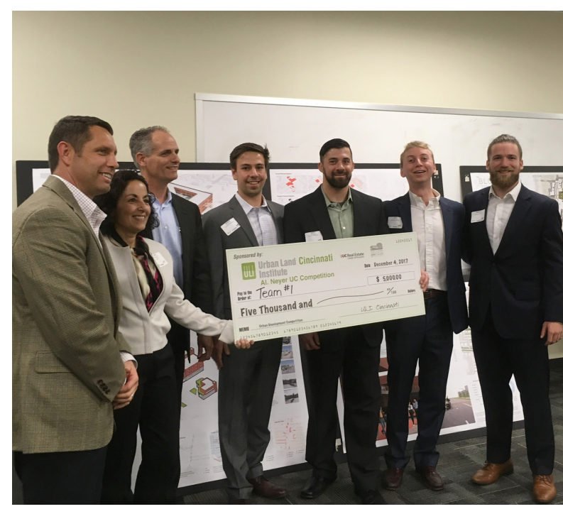
Local student competitors with representatives from the Urban Land Institute Cincinnati Chapter

A UC Forward-sponsored interdisciplinary student team comprised of Real Estate, Urban Planning, and Architecture students received national recognition for an urban development proposal for Toronto. Students worked closely with professional mentors from the Urban Land Institute (ULI) Cincinnati Chapter. Two out of three University of Cincinnati teams garnered an honorable mention from among 122 submissions. Conducted by UC Forward through a Service Learning & Civic Engagement (SLCE) course, this annual program integrates different disciplines in a competition format that mimics professional activity.